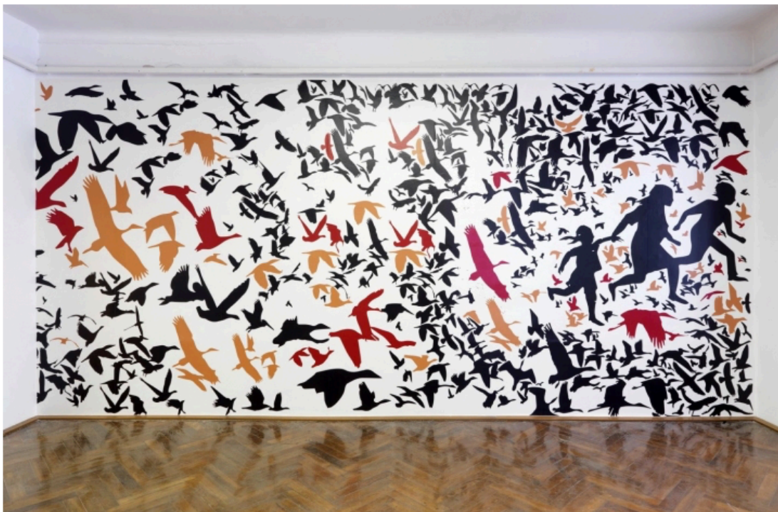
Jess X Snow "Unstoppable by Borders" (2017) digital print wallpaper on wall (photo by the author for Hyperallergic)

For Birth as Criterion , the recipients of the Grand Prize of the past five Biennial editions — Jeon Joonho (2007), Justseeds (2009), Regina José Galindo (2011), María Elena González (2013) and Ištvan Išt Huzjan (2015) — were invited to each propose one artist to participate in this year's event. The resulting five artists were then invited to nominate the next five. The process consisted of several rounds, a procedure that transformed not only the art content but also the biennial's structure, resulting in a 57% male to 43% female participation ratio. Šivavec seemed pleased with the results of these shared contacts, but told me this year's venture did not signal a permanent change in curatorial practise for the Biennial of Graphic Arts going forward.